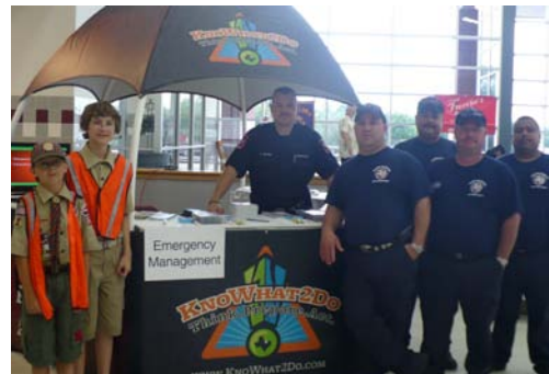
Glenn Heights Fire Department provided information on Emergency Management

Booths were provided by the various City services so customers could ask questions or just get information. Many thanks to Atmos Energy, DART, HILCO, Ellis County Appraisal, Tri-City Services, Keep Glenn Heights Beautiful, Waste Management, Trevino's Gym, Chamber of Commerce and Lion's Club. ONCOR provided an outside electric booth that demonstrated many ways to reduce the cost of electricity. Local Boy Scout Troop assisted with setup and cleanup. ❖